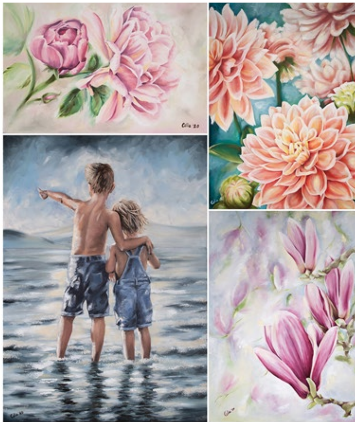
Figurative Children's Oil Paintings & Decorative Paintings